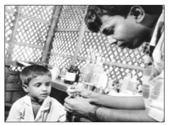
Blood sample taken from a refugee boy, Nayapara camp

The mortality rate in the camps remains low, although neo-natal deaths in recent years account for the highest number of deaths. It is suspected that these babies were born with too low a birth weight to survive in these circumstances. Low birth weight derives from a malnourished mother.