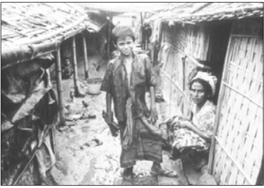
In between two rows of sheds, Nayapara camp

According to recent registration records, the average household size is 6-7 persons. The dwelling size remains constant regardless of family size. Many refugees have coped by modifying their units, dividing the 100 square foot space (9-10 square metres) into two rooms, or extending a 'veranda' into the passageway between sheds.