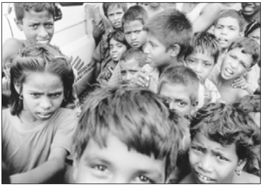
(Petterik Wiggers, MSF, 2000)

Médecins Sans Frontières-Holland March 2002