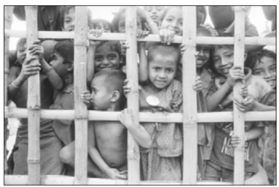
Children in Nayapara camp.