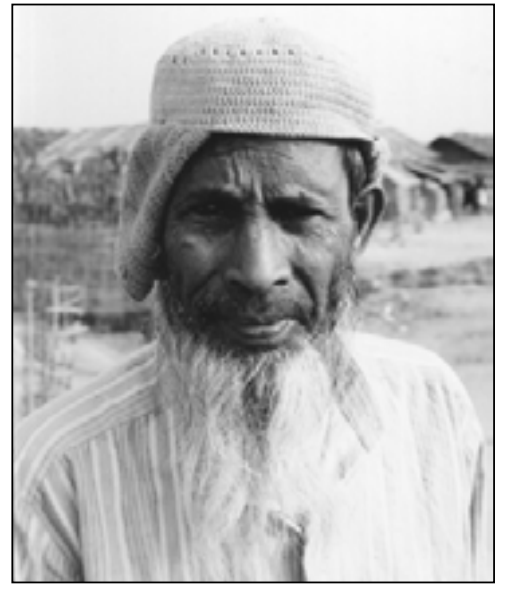
A Rohingya refugee man

As for the refugees, their eventual return in principle is not a point of contention. Many have expressed their desire to return; at issue is when. According to MSF's January 2002 survey, a large majority of the refugees said they wanted to go back when they were granted Myanmar citizenship, or when peace, freedom and/or democracy was achieved in