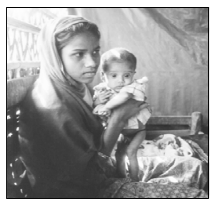
Infant and mother at Nayapara's therapeutic feeding centre

For 10 years running, the majority of the Rohingya refugees have been malnourished. In a closed-camp setting, the refugees still do not have enough food. Today, 58 percent of the refugee children and 53 percent of the adults are chronically malnourished.<sup>5</sup>