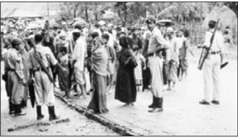
Armed security in Nayapara camp (Herman Smitskamp, MSF, 2001)

The experiences of violence and coercion over the years has inevitably fostered a climate of fear and distress among the refugees. In MSF's January 2002 survey, more than half the surveyed population said they sometimes or always felt unsafe in the camps (Table 11). Although some refugees told MSF that life in the camp was better overall because forced repatriation had stopped or decreased in recent months (Table 12a), others told of a different menace that had made conditions worse for them: aggression from the majee <sup>29</sup> and/or local population (Table 12b).