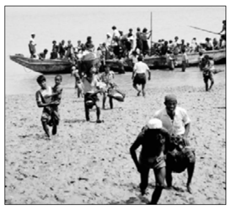
Rohingyas arriving on Bangladeshi shores, February 1992

The violence, impoverishment, and religious intolerance all conspired to again drive out approximately 250,000 Rakhine Muslims into Bangladesh from mid-1991 to early 1992.