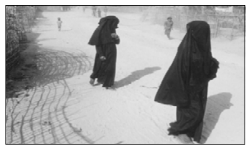
Rohingya women in Nayapara camp

Many incidents of aggression against the refugees occur while they are in the forested areas around the camps collecting firewood. The UNHCR does supply compressed rice husk to be used as fuel instead of firewood. But the refugees complain that the amounts distributed are too small for their needs, and therefore must compensate by fetching wood from the forests (Tables 10 and 10a).